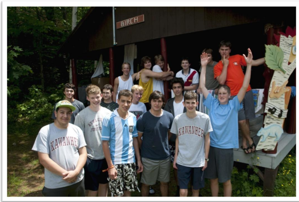
Birch Lodge – Leadership Training Program