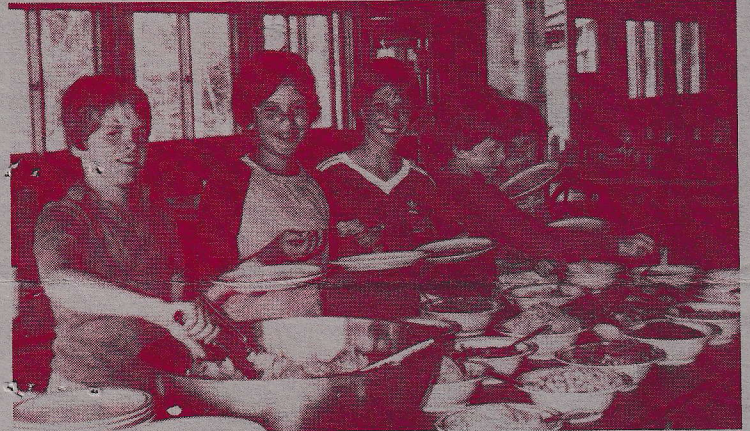
SUDS AND DUDS