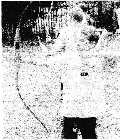
A Kawanhee Camper takes aim in Archery