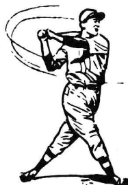
Final HAL Standings