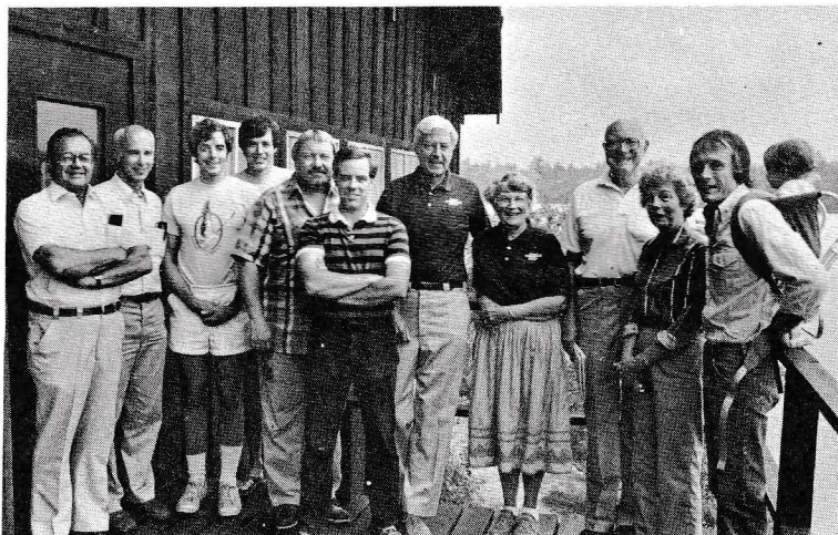
Kawanhee's Board of Directors at their Annual Meeting