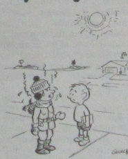
"Mom felt a chill..."