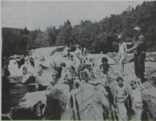
ROCK FORMATIONS at the "Pot Holes".