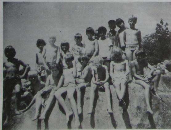
EAGLES, FALCONS, and PANTHERS at the "Pot Holes".

(2) The office phone will be unjacked and put away at 8:30 pm. The Camp Mother will receive incoming calls after that time. Parents should make every effort to call camp before 8 pm, except for emergency calls.