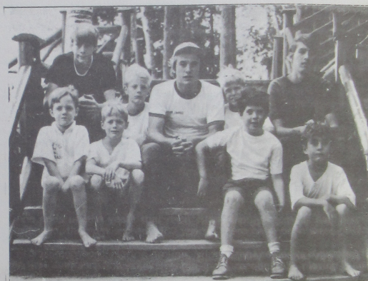
How many 1977 counselors and campers can you find in this photograph taken six or seven years ago? Next weeks Wigwag will furnish the answers!