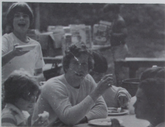
Breakfast at the temporary dining facilities