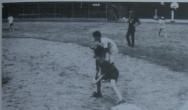
Kawanhee Little League action.