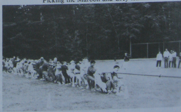
The Tug-of-War begins.