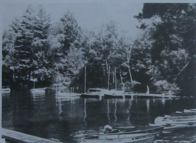
The waterfront at Kawanhee.