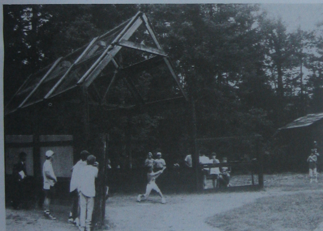
"It's going, going, gone!"