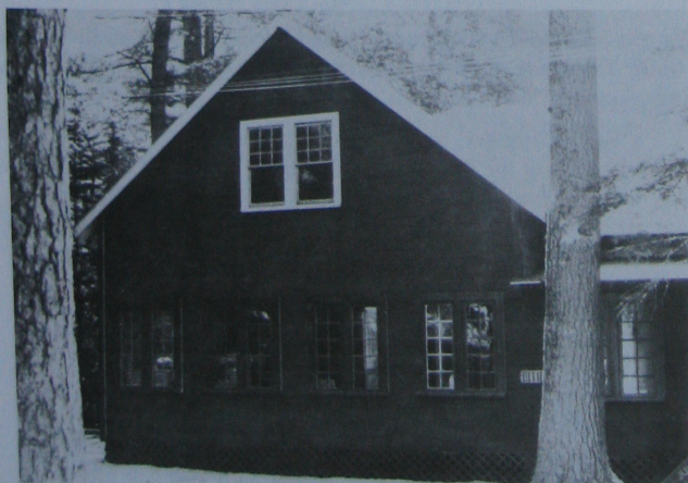
The new Kawanhee Office.

As the boys arrived on Sunday evening, each camper excitedly found his home for the summer and learned about the procedures and rules here at Kawanhee. On the first full day of camp, there