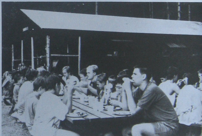
Enjoying the July 4th Cookout.