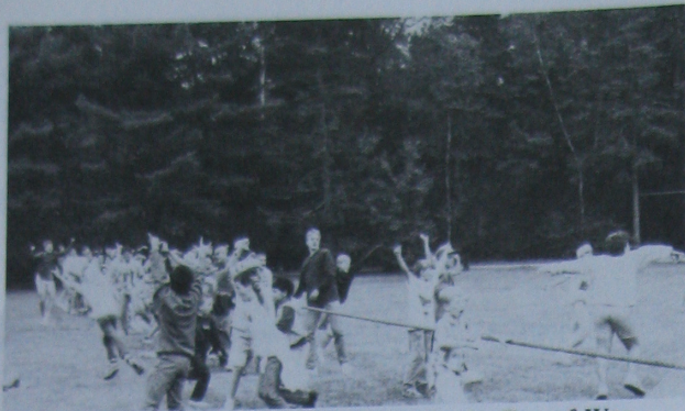
The Greys at the moment of victory in the Tug-of-War.