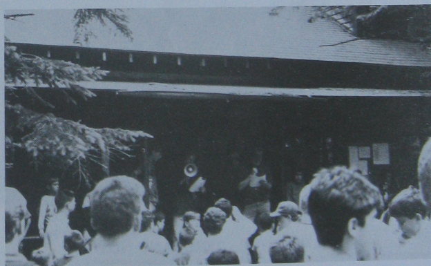
Picking the Maroon and Grey teams.