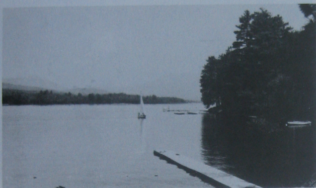
Lake Webb and the surrounding mountains.