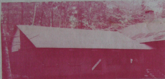
The new Wrestling Building

Once again "Big John" Detrick and a crew of workers accomplished a major building task just in time for the opening of Camp Kawanhee's fifty-third productive season. As campers arrived and stepped off their busses, they found that a new full-sized wrestling building had been com-