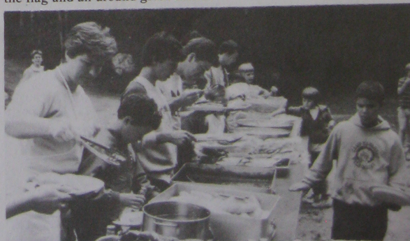
Hungry campers and staff line up for the delicious chicken barbecue on July 4th!