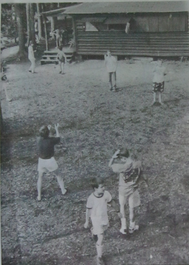
The Egg Toss at the Kawanhee Circus