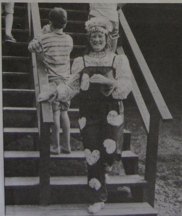
A Kawanhee Clown at the Circus

As the Wigwam went to print, baseball, soccer, basketball and tennis teams were getting ready for out-of-camp tournaments, and the Katahdin Mountain trip was getting ready to leave camp. And, of course, the fun continued at Camp Kawanhee!