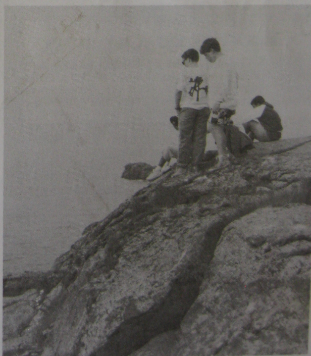
Looking out at the Atlantic Ocean from Monhegan Island

After the three-day trip, all Kawanhees who made the trip realize what a neat place Monhegan is and how lucky they were to make such a trip.