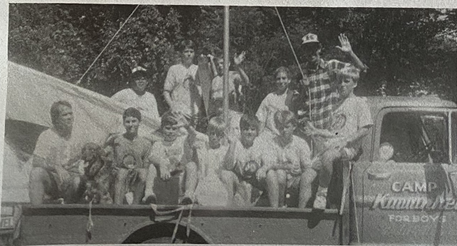
The Kawanhee Float in the Weld Heritage Day parade on July 28

I like Kawanhee and all the things that Kawanhee is, and I hope that it will never change because Kawanhee is the greatest camp I have ever been to.