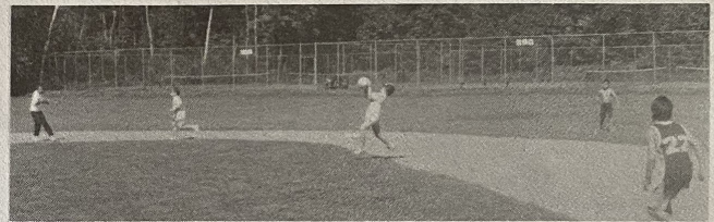
The Jr C's play kickball on Athletic Day