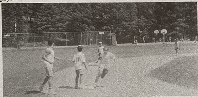
Rounding third base in Maroon-Grey softball on Athletic Day

The younger boys and the older boys both finished second, but our 13 and under teams won the championship --- good going guys!!