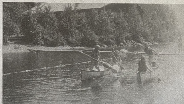
The Canoe Joust

During both trips, there was plenty of time for excursions around the island, visits to the gift shops and ship wrecks, and also hiking to the Monhegan Cliffs. Monhegan Island has the highest cliffs in New England which made for a great view! At the end of the week, all Kawanhees agreed that this was an outstanding trip, and as Kawanhee is the only camp allowed to camp out on Monhegan Island, most boys can't wait until next year's trip.