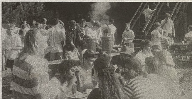
Enjoying the cook out with the girls from Camp Arcadia

Across: 4-Panther; 6-Birch; 8-Moose; 9-Crow; 10-Badger; 11-Hawk; 12-Falcon