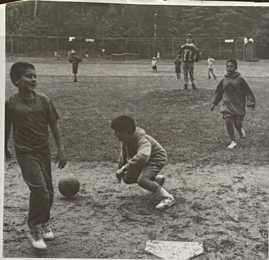
Maroon - Grey kickball action.