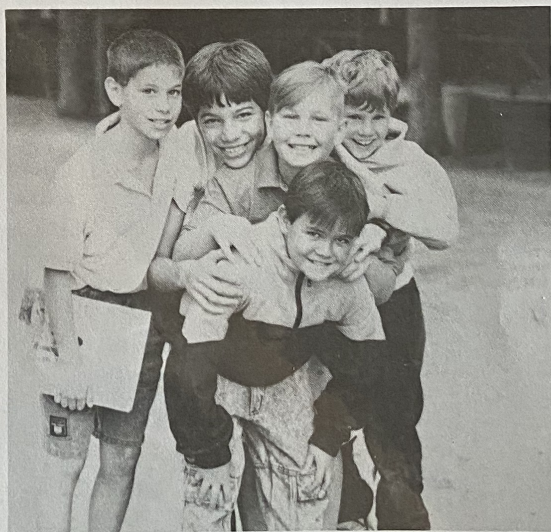
A happy group of Kawanhee campers.