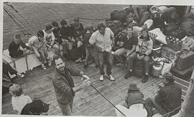
Monhegan trippers on the way to the island.