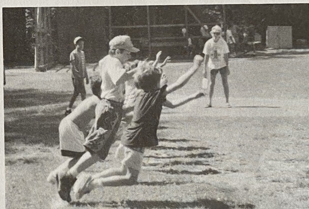
Junior C's Standing Broad Jump.