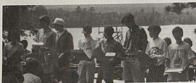
Boys who finished their Plaques.