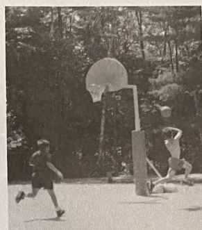
Basketball game with Camp Caribou.