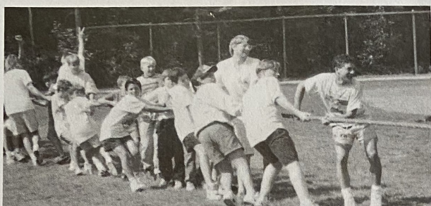
1992 August Tug of War.