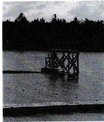
Look at the swimming dock!!!