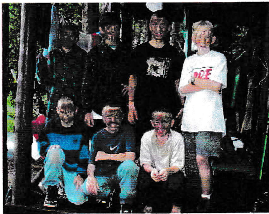
Hawk Lodge getting ready for 'Capture the Flag'!!