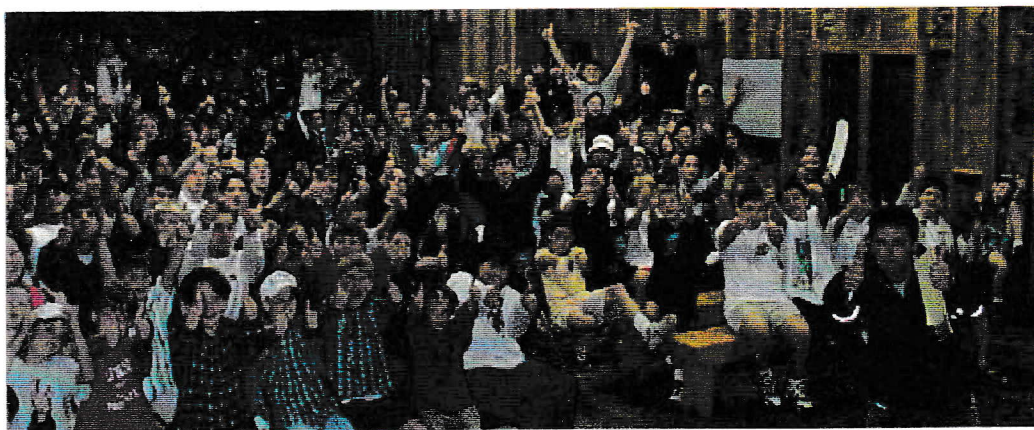
Thumbs up for Camp Kawanhee 1998!!!