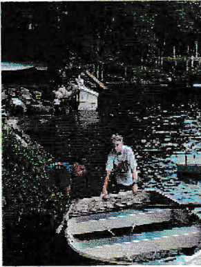
Where is the beach after a lot of rain?