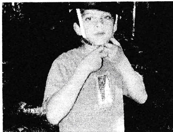
Getting ready for the Ropes course!

Christmas", I said, "I can't wait until Camp Kawanhee starts!" Right before, Halloween instead of saying, I can't wait to eat all that candy, I said, "I can't wait until Camp Kawnhee starts!" I'm a Camp Kawanhee-holic! I can't get over it! Why do people come here anyway? Why do people take the trouble to fly from Puerto Rico, Spain, or wherever, just to get to a silly boy's camp in Weld, Maine that only lasts four or seven weeks? They do that because this is Kawanhee, and like I said, Kawanhee is magic.