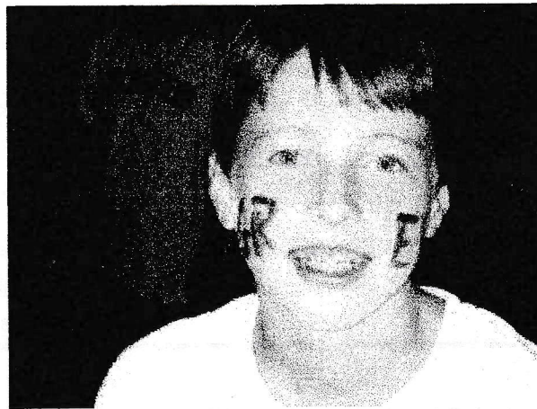
Grey Team competitor with Grey War Paint